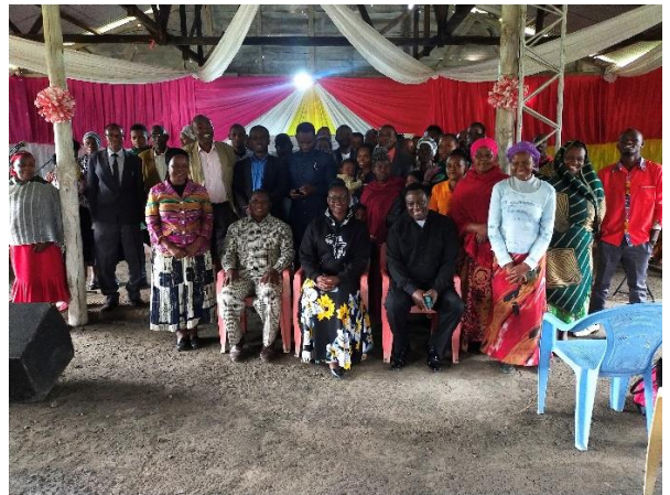
Above: One of the group discussion sessions. Right: Commissioned peacebuilding and discipleship grandaunts of Moshi, Tanzania.