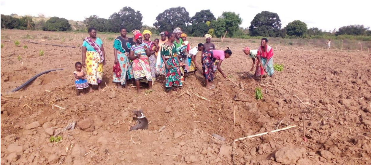
PHARP women of peace beneficiaries tilling the harvest.

PEACE AND DEVELOPMENT WORK IN JILORE, MALINDI: We are grateful for the peace work and development happening at the PHARP-Centre. The beneficiaries are grateful for the rains that reached the area. Beneficiaries have been engaged in discipleship as well as tilling the land for farming. We pray that the rains continue and there be a plentiful harvest.