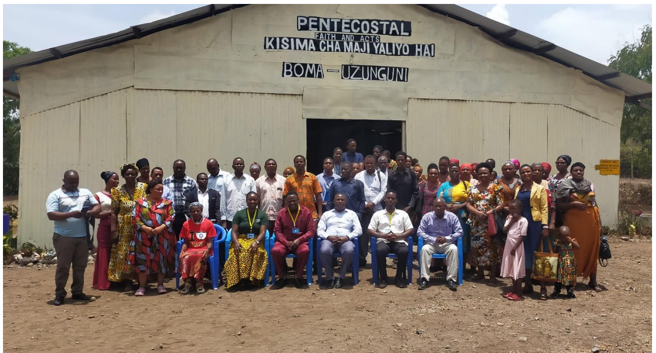
Peace and Disciple makers of Kisima Cha Maji Yaliyo Hai- Bomang'ombe Church, Moshi-Tanzania.

Know that the LORD is God. It is He who made us, and we are his; we are his people, the sheep of his pasture- Psalms 100:3