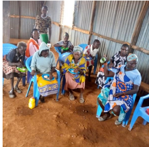
Top left: distribution food supported by friends and partners. Right: the elderly women having a meal before walking long distances back to their homes.