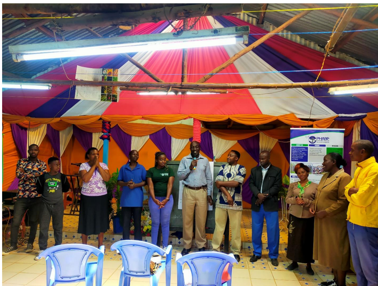
Leaders called to radiate God's light and glory: Redeemed Gospel church, AMREF Grounds- Kibera, Nairobi County