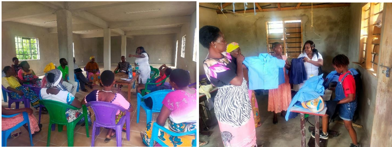
PHARP staff encouraging the beneficiaries to use what they have in their hands for the glory of God and the good of the community.

On 17 th to 19 th : PHARP team made a visit to the beneficiaries that meet regularly at the PHARP center- Jilore, Malindi, Kilifi County. The 18 group leaders present thanked God that they and their members have been enabled to see the new year. Although 2022 saw some members passing away or their extended family members pass, they are delighted to get another opportunity to serve God, family and the community. Their hearts desire is that, whatever they lay their hands on to do; be it farming, sewing or rearing of domestic animals, the Lord shall bless their hard work and double their efforts. It is amazing to read and learn how God used the staff of Moses to perform miracles. Likewise, we learnt that we should not limit God by any means. He can make use of what we each have to solve our problems and those of others. The leaders are determined to be salt and light in their families and communities as they seek to be better peacemakers and disciple makers.