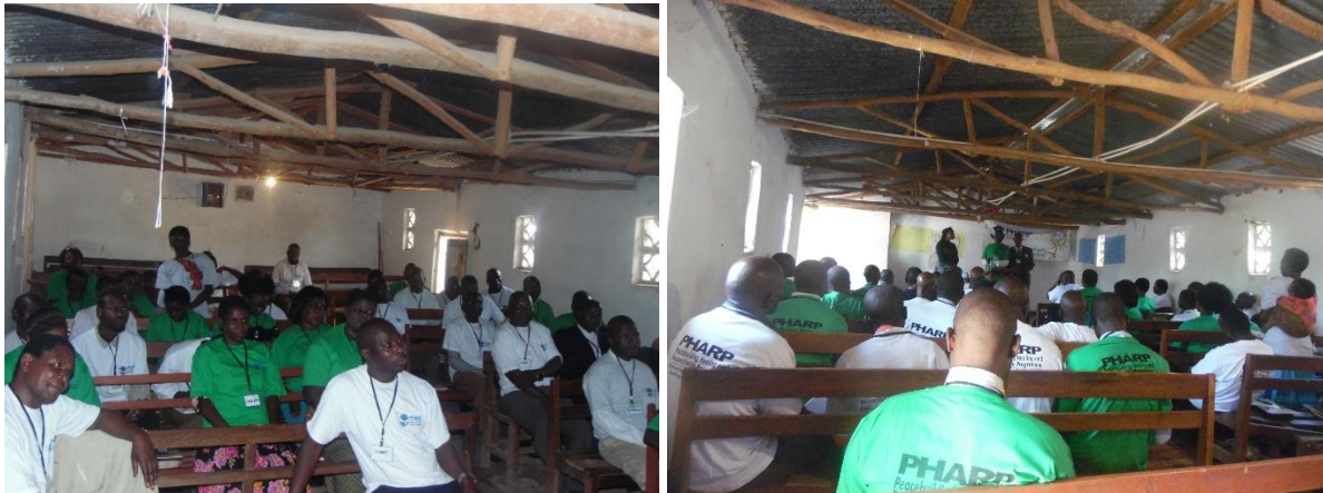
participants listen to testimony

deacon, but for some time I used not to trust God completely, but very active in the programs of church. one day my daughter went out to look for firewood and it reached dark without her return. We searched everywhere without seeing her. But as I was praying, the question; 'Lord what are you teaching me now through this circumstance?' came to mind. And I remembered the pastor reading it to us. Now I am very happy that my daughter came back safe and I got my own book since I was invited to this training! I will be reading it with my family every day without going to the pastor. "