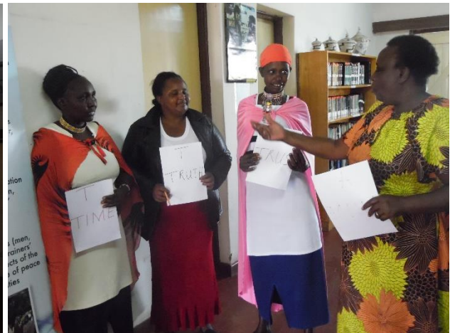
Left: Women group leaders in fellowship with PHARP director. Right: Women groups leaders being taught principles of discipleship

On 20 th October: PHARP team visited the Church of God of Prophecy-Kibera Slum with a membership of 80 congregants and 20 discipleship groups meeting in 7 locations. PHARP in partnership with this local church have been supporting in the area of discipleship and capacity building of the pastors, lay leaders and church members of the church.