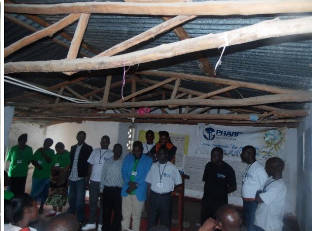
Pastors being taught on how to use the TSOAR material

The pastors were much encouraged and thanked PHARP and tSOAR-USA for this most needed capacity building which they so much needed and is going to help them revive and energize their churches.