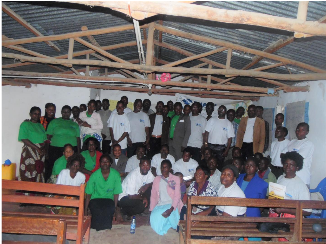
Malawi Disciples October 2019.