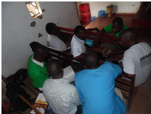
Participants in different group discussions

One of the pastors shared how he got to know the book 'Finding your place in the world' through his fellow pastor who attended discipleship training in May 2018. When I first got to read my friend's book, the first chapter I landed on was on Reconcile. I quickly read the introduction and I realized that in our church there is a big problem. He realized that the church was not doing enough to reconcile sinners to Christ. The church was more focused on growing numbers as this translates to more giving, but the leadership was not intentional of disciple making that helps believers to grow deep into the word of God. 'Today I am more than challenged. If my bishop is not keen on discipling the idle youths because they are seen as trouble makers, then me who has learnt and equipped with material, I will be deliberate to reach out to the idle youths I pass by in the market and the bus stop as I go home from church.