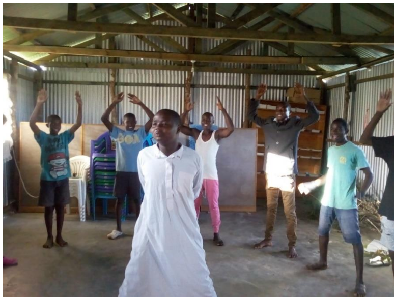
Top left: Women paying for the cultivating tractor. Right: Planting of banana tree seedling. Below left: Youths engaging in beadwork. Right: youths in a training session

The goal of this intensified discipleship program is to respond to a request of some professionals and any other interested person who can only be available on weekends. They have a specific call from God for their lives to serve within ministry, but didn't know how they can be equipped for such ministry. PHARP is therefore willing and already working towards equipping such a category of people with an intensive 6-month discipleship training.