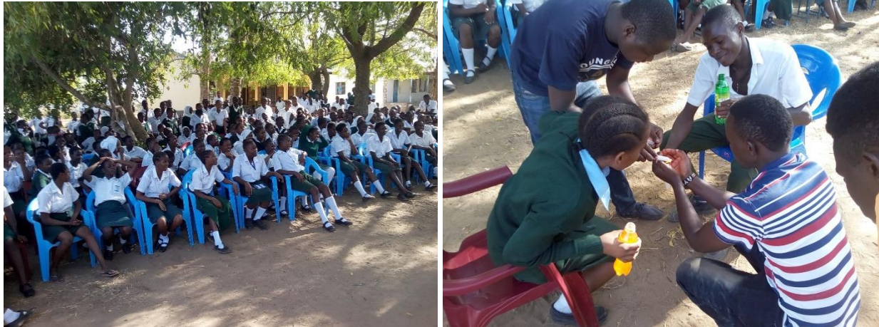
PHARP field officer (stripped shirt) facilitating a discipleship outreach

The field officer visited two new schools with a purpose of introducing these high school students to embrace discipleship and most importantly, to create time for God's word daily.