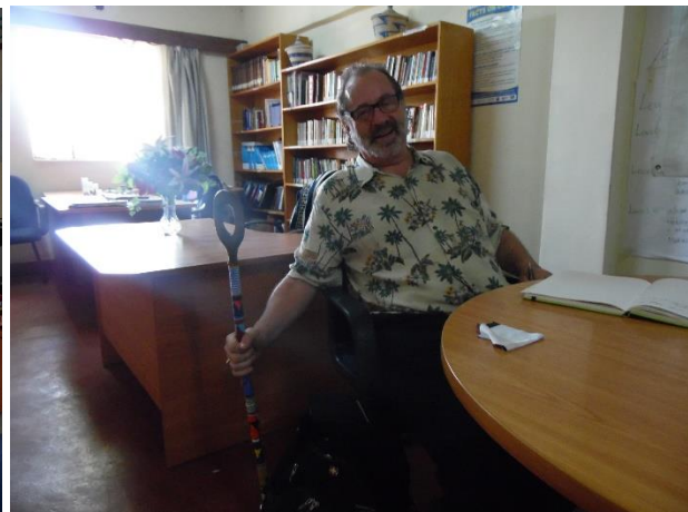
Left: Director of VOHFA getting to understand more a discipleship manual used in training. Right: Director show casing a support stick done and decorated by women through women empowerment program.